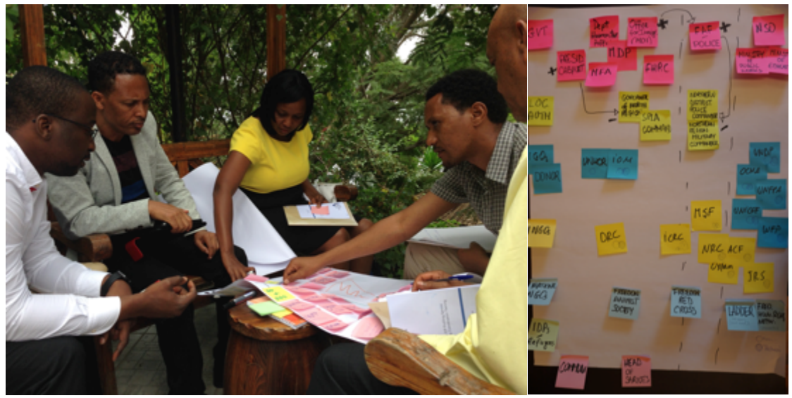
Left: Participants map the actors in Freedonia at the April PCT, and Right: an initial stakeholder map as presented by a group of participants during the June PCT.