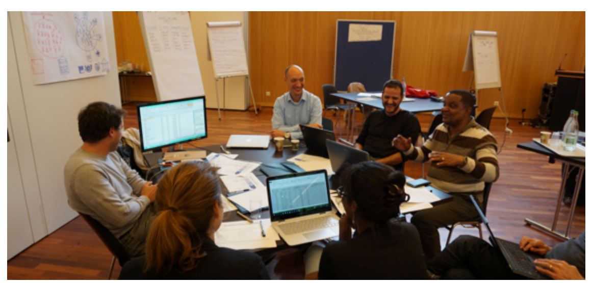
Above: Participants discuss findings with a JIPS facilitator during a data interpretation session at the June Global PCT in Switzerland

"I could stay an extra week doing all the technical stuff, thanks for another interesting day."