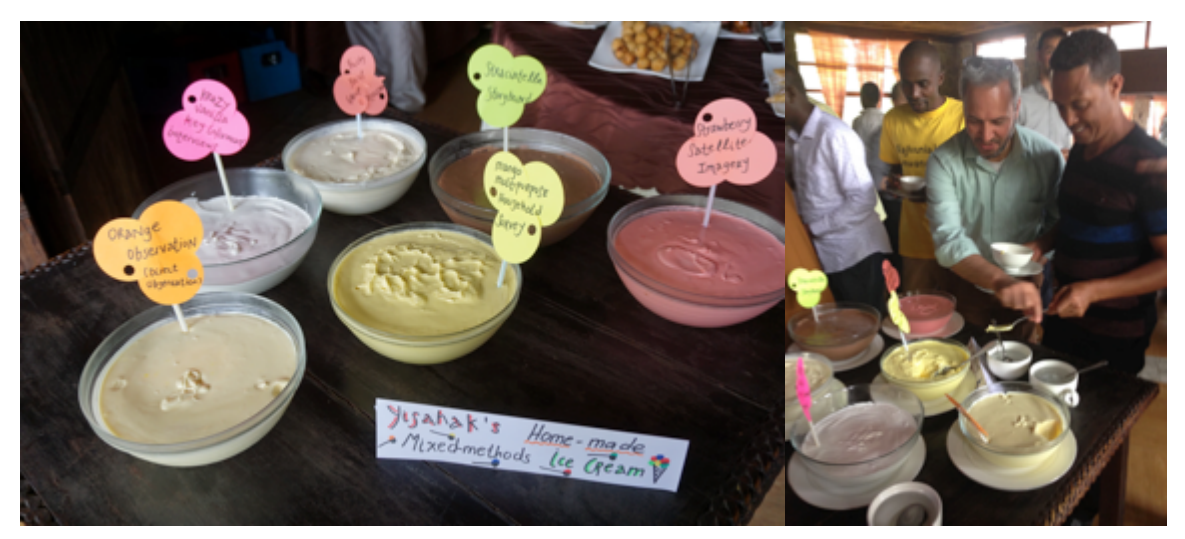
Above: Participants enjoying "mixed methods" handmade ice cream during a break at the April Regional PCT in Ethiopia.

time spent in preparing several days in advance of the training at the venue itself.