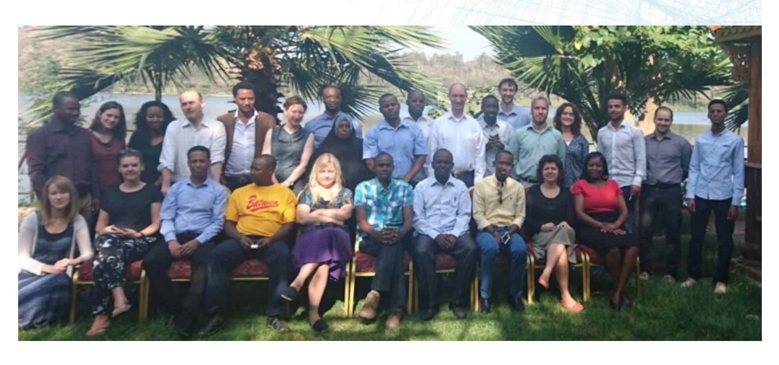
Ethiopia, April 2-8 & Switzerland, June 12-17