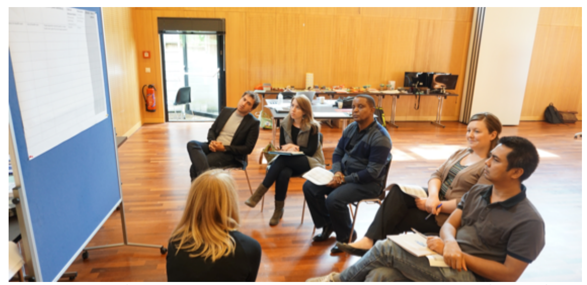
Above: A group of participants discussing and developing an analysis plan for a profiling exercise in Freedonia on one specific theme, guided by a JIPS facilitator

"The small groups were great. Melissa was super helpful and I can use this."