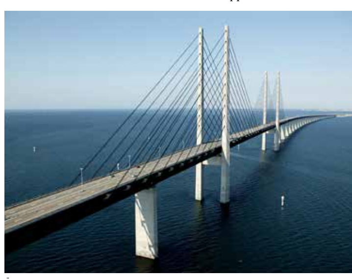
Öresund Bridge, which links Denmark and Sweden and serves as the main entry route for refugees into Sweden.

In October, the central government suddenly started reacting. A plethora of draconian restrictions was announced to provide 'respite' for the Swedish asylum reception system. The number of asylum seekers had to be drastically reduced, it was argued. Beneficiaries of protection would in the future only be granted temporary stay, and their right to family reunification would be limited to the minimum required by international and EU law.1 At Sweden's Schengen borders, border checks were temporarily reintroduced and, since January 2016, bus, train and ferry companies are no longer allowed to carry passengers without identity documents from neighbouring Denmark or Germany to Sweden. Even the approach towards