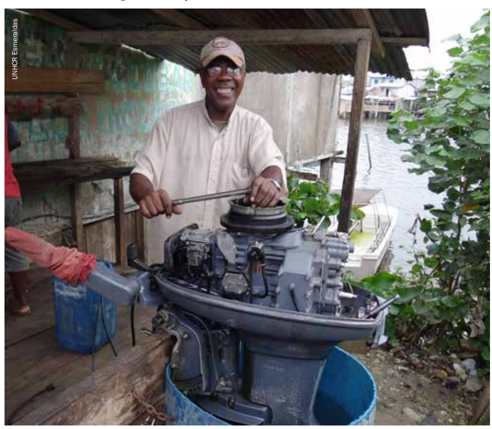
Refugee entrepreneur beneficiary of the business incubator.