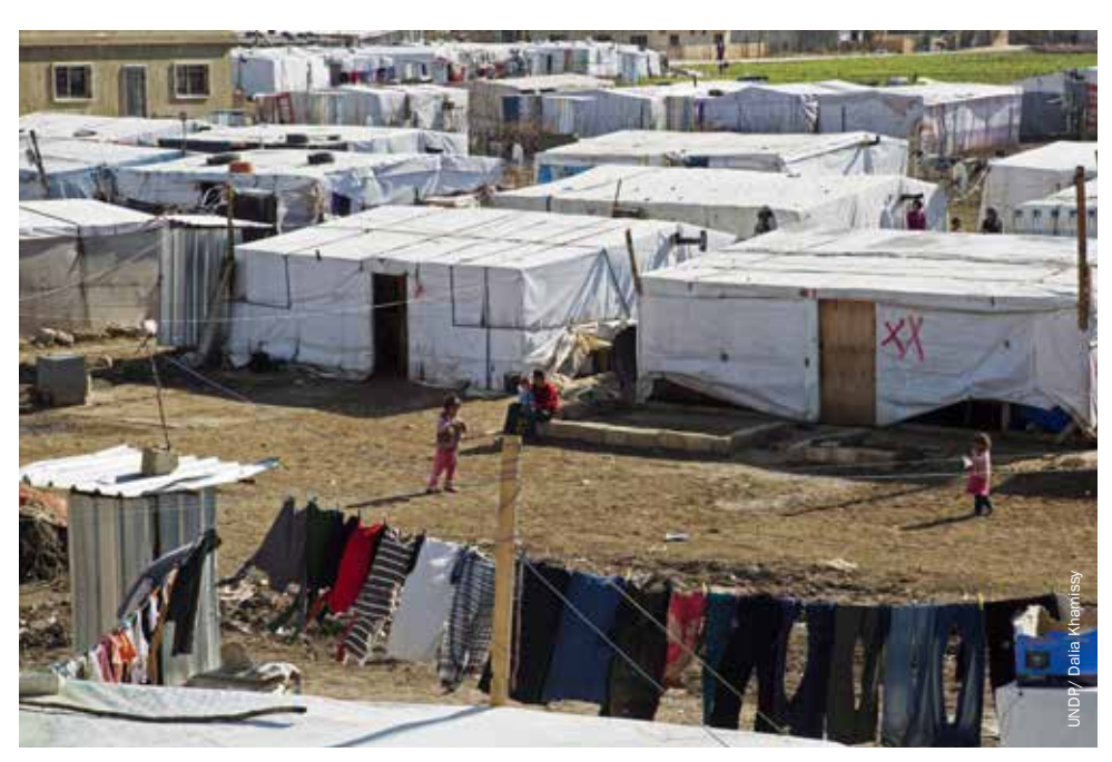
Syrian refugees' tented settlement in the village of Gaza, in the Bekaa Valley, east of Lebanon, 2014.

chapter' within the Connecting Business Initiative (CBI) being launched at the World Humanitarian Summit in May 2016. It should also interact with the Business Mechanism established by the Global Forum for Migration and Development' and ensure interconnectedness with the existing UN Global Compact<sup>5</sup> and Business Call to Action<sup>6</sup> platforms. It should support the Solutions Alliance Private Sector Group to work with the National Groups to connect them to businesses of all sizes. Finally, it should be user-friendly for businesses and articulate the 'ecosystem' of support for businesses to engage in displacement solutions.