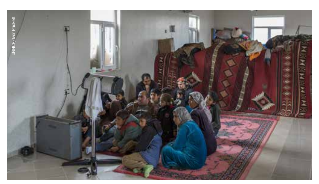
23 members of one family live in this community building in the Turkish village of Kanatli, having fled their homes in Kobani, Syria, 2015.

Uganda and Zambia, and reviewing and revising displacement policy such as assessing new directions for IDP subsidy schemes in Georgia. It also includes a wide array of analytic work such as scoping out the development needs of the displaced across the Great Lakes Region of Africa and Horn of Africa, and poverty profiling of Syrian refugees in Lebanon and Jordan and of the Malian displaced across West Africa.