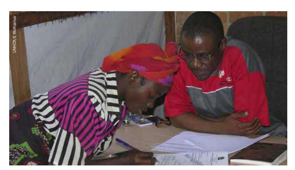
Burundi refugee woman applying for Tanzanian citizenship in 2008 in Ulyankulu Settlement for the '1972 Burundi refugees'.

still had relatives in Burundi and were able to regain their property settled in the areas they were familiar with. Many others, however, were housed in Peace Villages built for the purpose of reintegrating IDPs and returning refugees.¹ Access to land became an immediate point of conflict and contestation. People's social networks had become extremely weak back in Burundi and when in May 2015 civil unrest broke out many repatriated refugees fled again to Tanzania. Some of them wanted now to receive Tanzanian citizenship but TANCOSS had stated clearly that the decision to opt for repatriation could not be reversed.