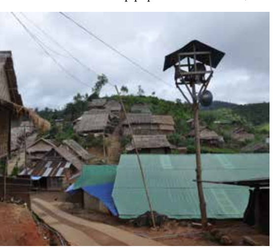
Loudspeaker in Umpiem camp

Humanitarian practitioners form the upper tier of the hierarchy of control over information disseminated in the camps, as they are the primary sources of information accessible to the camp committees, and their decisions about what information is provided or is not provided directly affect camp residents. Humanitarian practitioners described making decisions about what information to disseminate on an ad hoc basis in accordance with their own notions of the relevance of certain details to the camp populations. However,