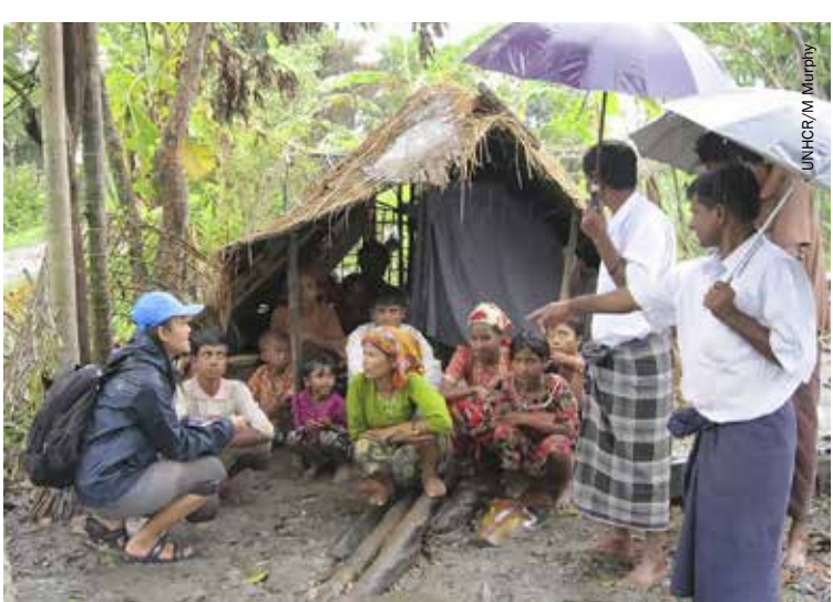
UNHCR staff visit villagers living in makeshift shelters after their homes were burnt down in inter-communal violence in Kyauk Tauw township, north of Sittwe, Rakhine state, Myanmar, 2012.

as those most responsible for the conflict of 2012, having permitted, if not instigated, the extreme nationalism that fuelled the violence. A widespread opinion was that Rakhine nationalism was being used rather than it being a primary driver of the conflict. Each community we spoke with expressed the view