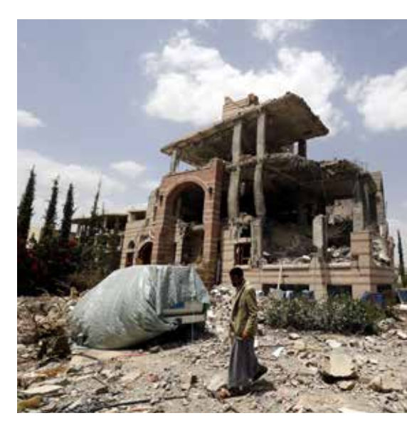
Home destroyed by airstrikes in the Nahdah neighbourhood, Sana'a, Yemen, January 2016.

A comparative analysis between displaced and non-displaced (or other relevant groups, such as economic migrants or returning refugees) can be a game-changer. Such an analysis often informs a more targeted response by building on a more nuanced analysis of the skills and capacities as well as the needs and protection concerns of the different groups. With this comes a better understanding of development issues faced