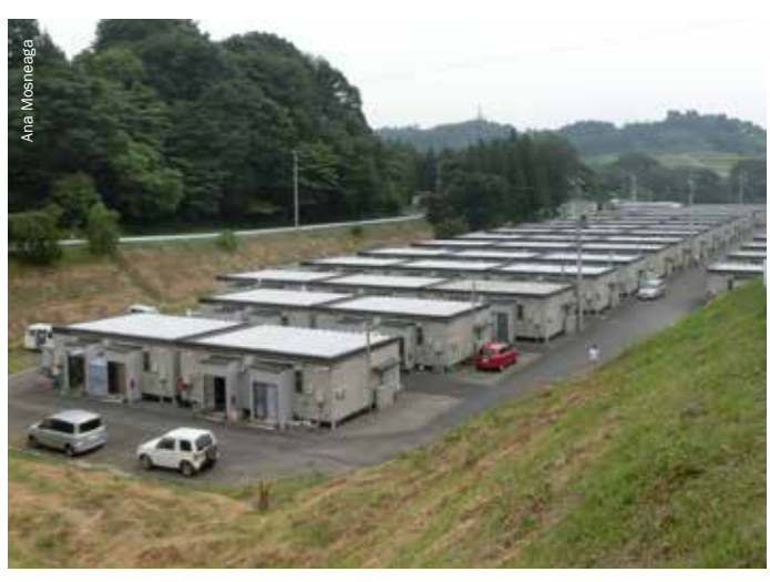
Pre-fabricated temporary housing for IDPs displaced in 2011 following the nuclear disaster, Fukushima prefecture, Japan. (photo taken June 2014)

The disruption of community life and social networks can further alter the positions of the elderly in their families and communities. Many of the elderly who were