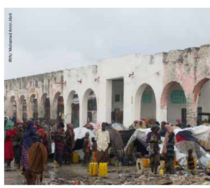
IDPs in Mogadishu, Somalia, 2011.

A frequent request from government, and humanitarian and development partners directed to the Special Rapporteur's Office is for help to 'operationalise' the text of the IASC Framework, in particular for help to use the eight criteria it lays out, in order to better analyse the displacement situation on the ground. In response, the Special Rapporteur's Office and the Joint IDP Profiling Service (JIPS) have teamed up to try to fill this gap by combining the IASC Framework's definition, principles and criteria for durable solutions with JIPS experience in facilitating collaborative profiling processes. The aim is to develop a global toolkit for analysing durable solutions and developing a strong baseline against which to monitor progress over time.