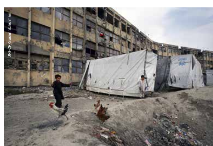
IDPs in Kabul, Afghanistan.

A durable solution is not automatically attained upon repatriation but depends on a complete restoration of rights and protection ('re-establishment', using Convention language). Including displacement issues in stabilisation agendas therefore requires constructive dialogues between humanitarians and policymakers, as well as between humanitarian and development actors. These dialogues should recognise that in complex settings, such as Somalia or Afghanistan, humanitarian and development needs coexist at the same time.