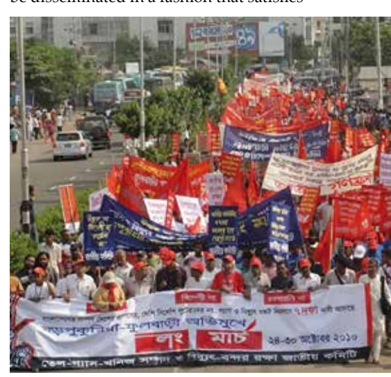
Local people against the Phulbari Coal Project on a seven-day, 250-mile protest march, October 2010.

This is not to suggest that planning cannot or does not occur in these circumstances. The issue is rather whether planning under these circumstances has the safeguarding effect that is pre-supposed in international and corporate policy frameworks. The provision of information, choice and opportunities for consultation are all possible, even when resettlement planning occurs on an ad hoc or opportunistic basis. Participatory activities can be constructed even within heavily compressed timeframes, and information can be disseminated in a fashion that satisfies