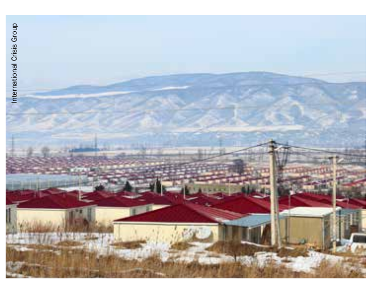
Tserovani IDP settlement, Georgia, 2012.

and few communal spaces, which limits social interaction, particularly among the elderly with poor mobility. The assignment of individuals from the same villages to different accommodation centres also meant that many elderly were disconnected from their old networks and consequently live alongside complete strangers. Another problem in such centres is the lack of access to plots of land, which many elderly identified as being important not only for their economic stability but for their ability to feel productive.