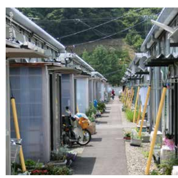
Close-up (taken in June 2014) of pre-fabricated temporary housing for IDPs displaced in 2011 following the nuclear disaster, Fukushima prefecture, Japan.

In general, the elderly tend to face greater challenges than the young in restoring their pre-disaster standards of living and regaining their economic welfare. In Georgia, high rates of unemployment and low public pensions have been particularly problematic given high and persistent health costs among the displaced elderly. Although Japan has a welldeveloped pension and social security system, many older IDPs, especially from the rural areas contaminated by radioactive fallout, have experienced soaring living costs. Many previously had land on which to produce most of their food and had often benefitted from rich natural resources available in their communities. Once displaced, their perception was that investing in buying new land or agricultural equipment was both too costly and risky due to persistent