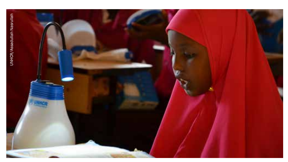
In order to support school children in their studies, UNHCR recently distributed over 12,000 solar lamps in 48 schools in the five Dadaab camps. Priority has been given to female students, who have less time to study after school.

increasing reliance on fuel supplies as well as sources of local pollution. While a new system is now being implemented to ensure adequate access to energy for households and businesses at a more reasonable cost to the agency, greater foresight in the initial crisis planning process could have mitigated the financial and human costs.