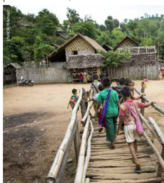
Third-generation refugee children walking to school in Ban Mai Nai Soi refugee camp on the Thai-Myanmar border. June 2014.

Humanitarian agencies are not equipped to address the long-term developmental needs of those in protracted displacement, and yet this has been the default for many years. If the policy framework stays in a short-term humanitarian mode during protracted displacement, there is every potential for this to breed exclusion, poverty, degradation, possible radicalisation, and new conflict