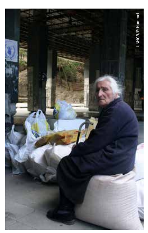
The 67 families of IDPs living in this collective centre in Georgia fled Tskhinvali in 1991. (photo taken 2008)

Dialogue on all of these issues is most effective if it addresses the concerns of host countries, if it includes a focus on improving conditions of host communities and thereby of the displaced as well, and if it proves that allowing refugees to use the capacity they have is beneficial to the host country. Above